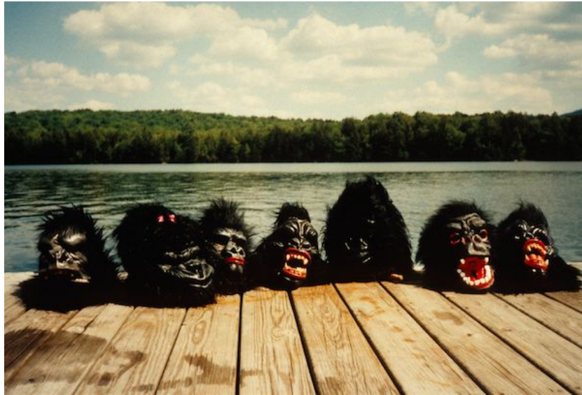
From the Guerrilla Girls BroadBand's show "#ProvokeProtestPrevail," recently at the Bruce High Quality Foundation University.