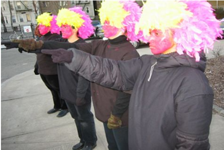
The activist group the Brainstormers, “pointing out” the gender imbalance at the 2005 “Greater New York” show at MoMA PS1.

our ideas not just about female artists, but about the way the contemporary art system in general works (or doesn't).