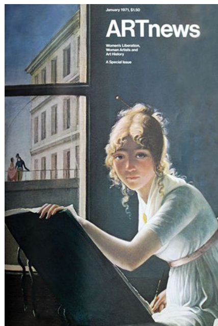
The cover of ARTnews , January 1971.